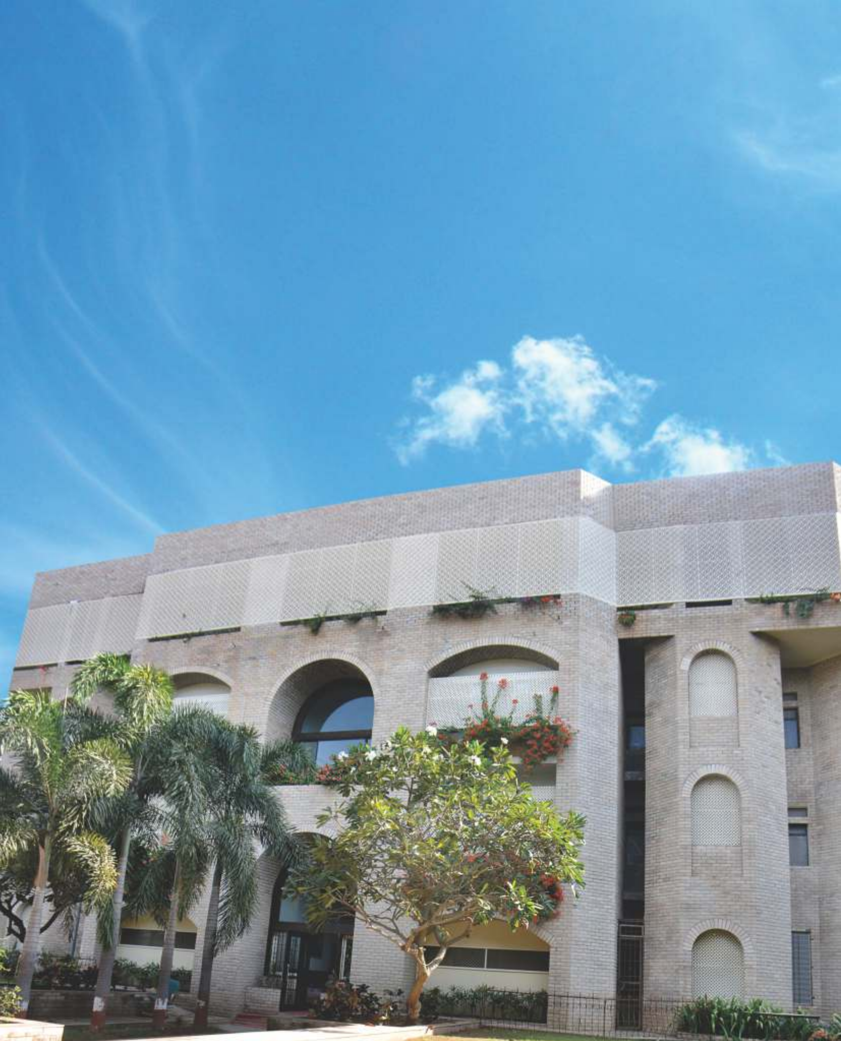
RANI PADMINI – THE GIRLS' RESIDENTIAL HOUSE