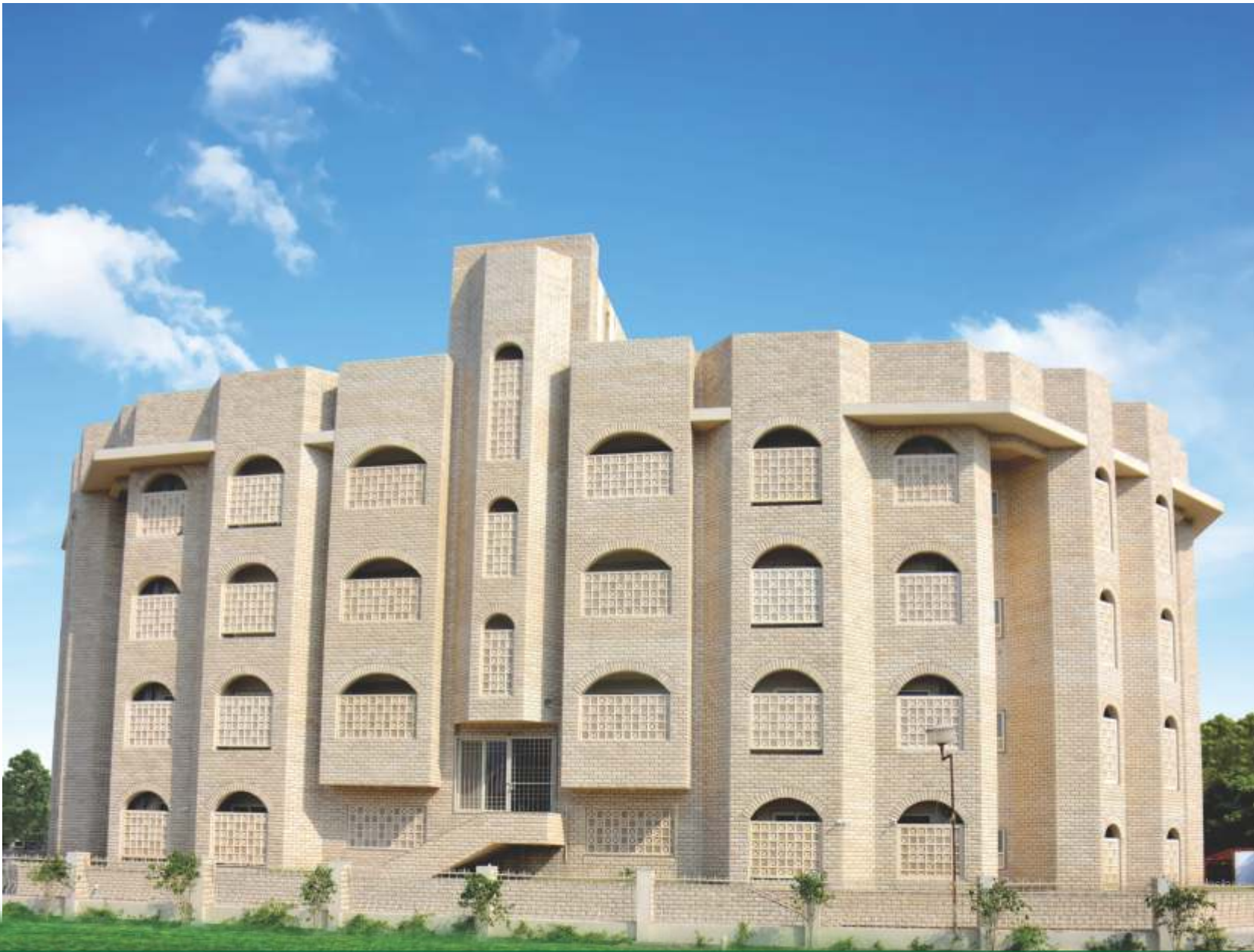
FORT PRITHVIRAJ – THE BOYS' RESIDENTIAL HOUSE