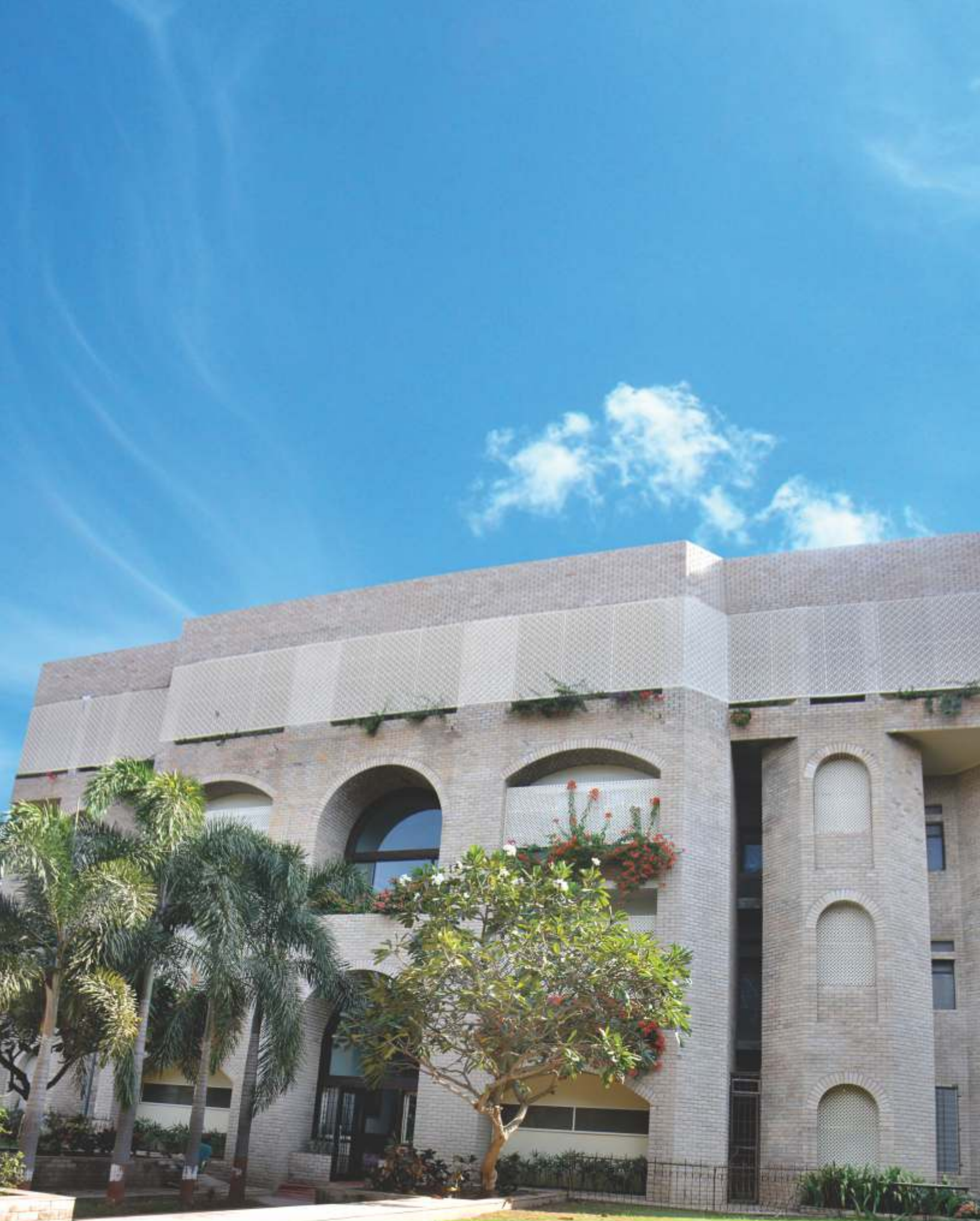
GIRLS' BOARDING HOUSE