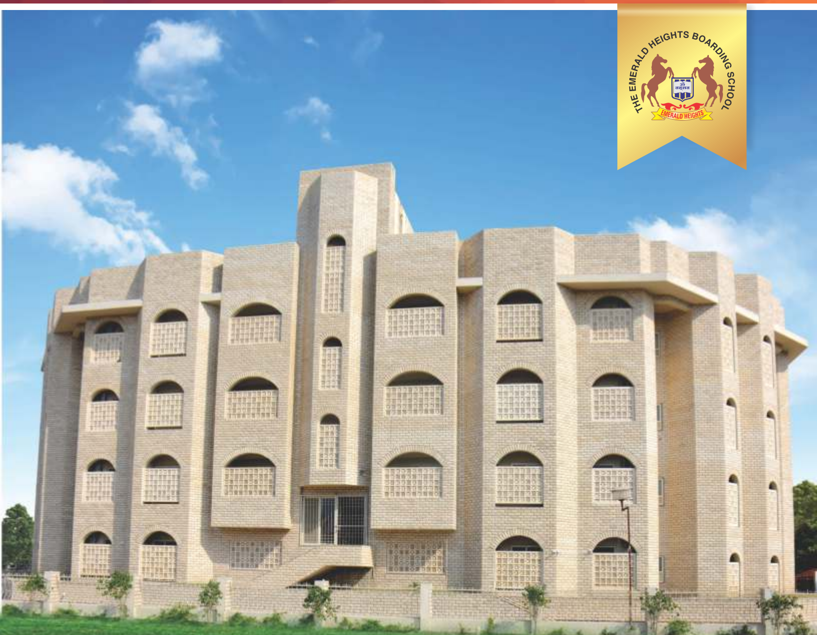
BOYS' BOARDING HOUSE